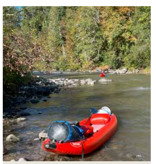
Riparian knotweed and butterfly bush management on the Sandy River.