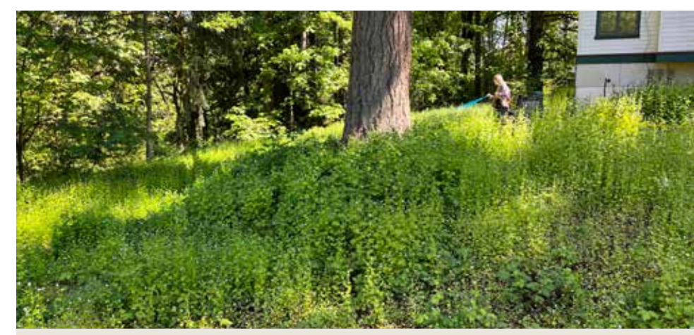
This past year resulted in the discovery of several isolated garlic mustard infestations, which the WeedWise program is pivoting to manage.