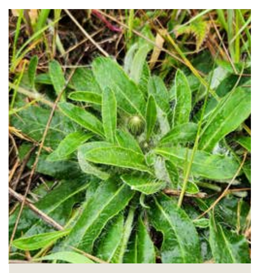
Mouseear hawkweed is one of several hawkweeds being actively managed.