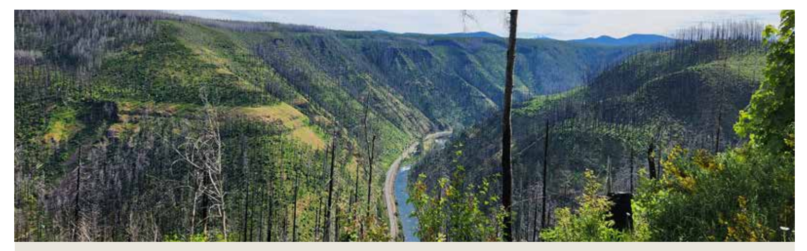
Mt. Hood National Forest: This past year, the WeedWise program added three new team members to support post-wildfire infrastructure redevelopment on the Mt Hood National Forest following the Riverside and Beachie Creek Fires.