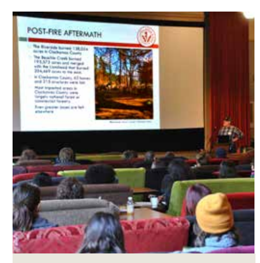
WeedWise shared its post-wildfire experiences with our CWMA partners.