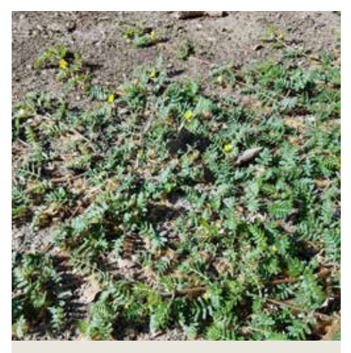
WeedWise is managing puncturevine throughout Clackamas County.